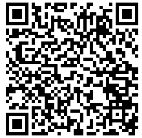
Vista School Foundation QR code