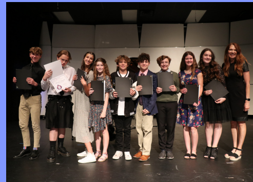
9th Grade Recognition Night