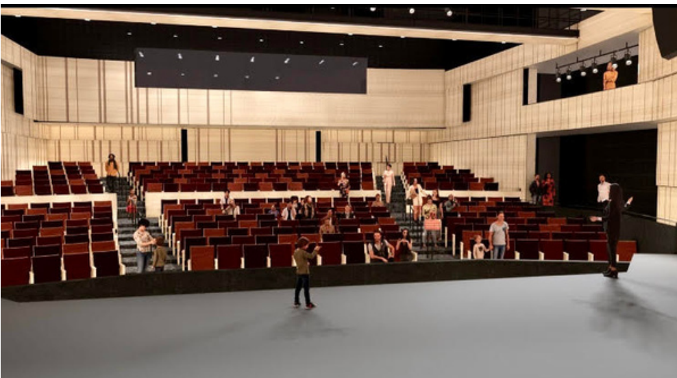
Rendering of the new theatre

Be a part of Vista's history while supporting the performing arts! For a donation of $500 or more you will have the name of your choice engraved on a chair in the new theatre. Create a lasting legacy by dedicating a seat to family, a business, or a friend! For more information, contact the Business Office, 435-673-4110.