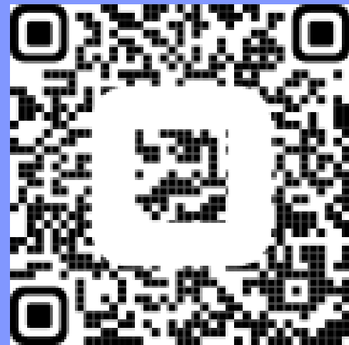
Theatre Seat QR code